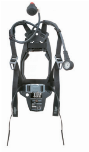
Dräger PAS® Lite

Incorporating new materials that are shaped and formed to provide maximum comfort at both the shoulders and the waist, the carrying system has been developed to reduce back strain, stress and fatigue. The innovative harness design ensures an excellent weight distribution at the shoulders. The inclusion of durable rubber coated fabric provides excellent wearing comfort and chemical resistance, whilst also performing well during the flame engulfment test in line with EN137 Type 2.